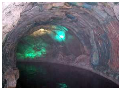
A boat ride on an underground lake transports visitors to Maropeng's remarkable exhibition on human origins

International representatives report back