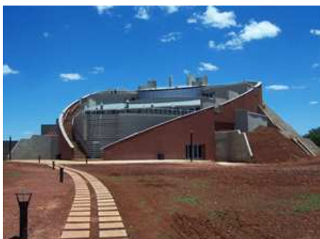
The space-age design of the back view of the Tumulus building contrasts with the ancient and organic feel of the front view