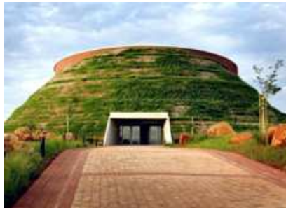
The Tumulus building at Maropeng, designed to resemble an ancient burial mound, has a soil covering that allows grass to grow on the structure

The Association of Southern African Indexers and Bibliographers Conference and International Triennial meeting will be held in South Africa at the Maropeng Heritage Site on 9 & 10 March 2009.